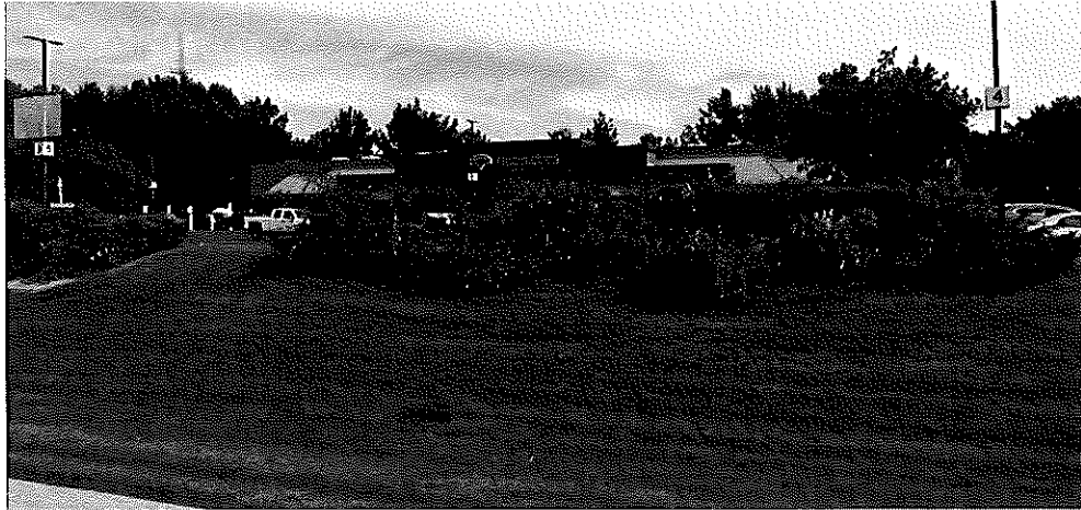
Use of Vegetative Berm to Provide Partial Screening