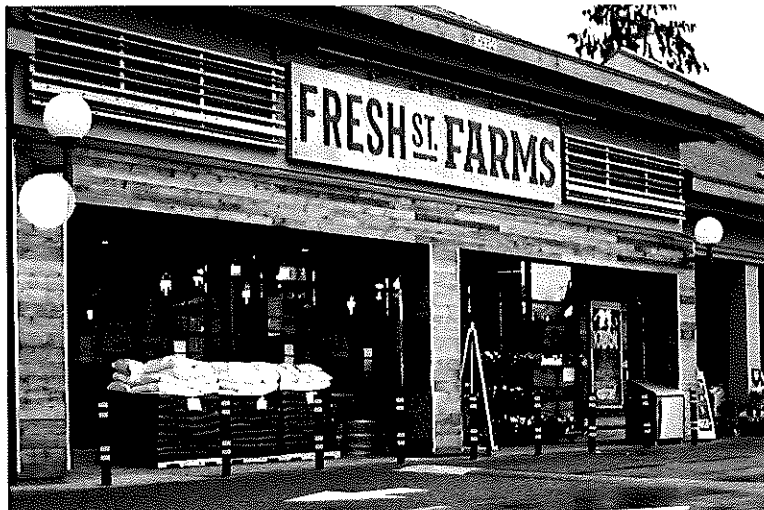
Exposed Wood and Attractive Architecture Elements