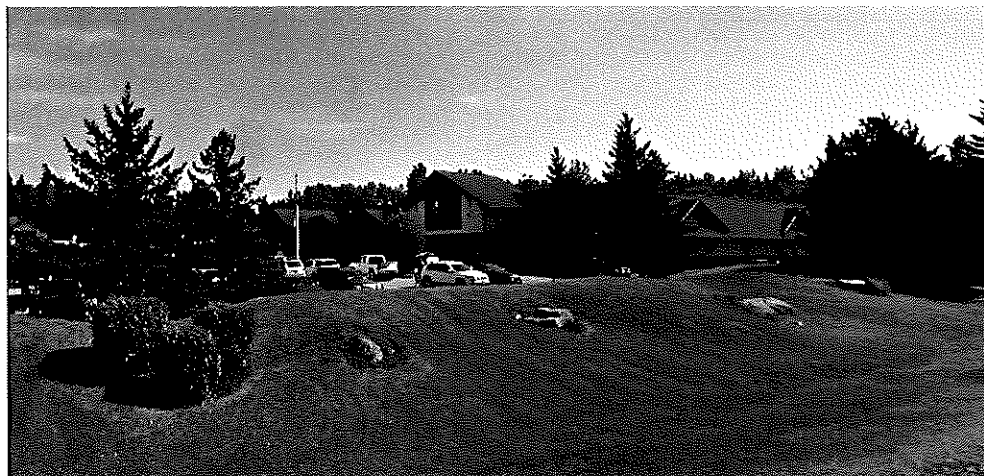
Use of Earth-Tone Colors and Vegetative Berm