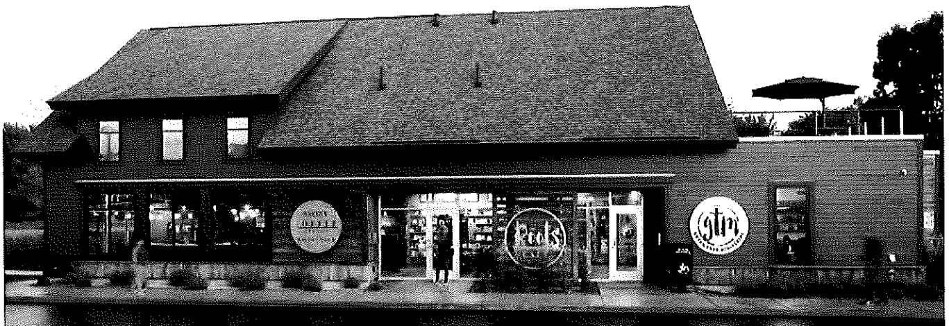
Modern Retail Design with Low Profile & Use of Earth-Tone Colors