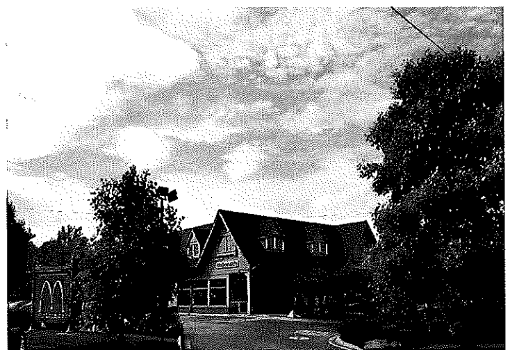
Alternative Franchise Architecture