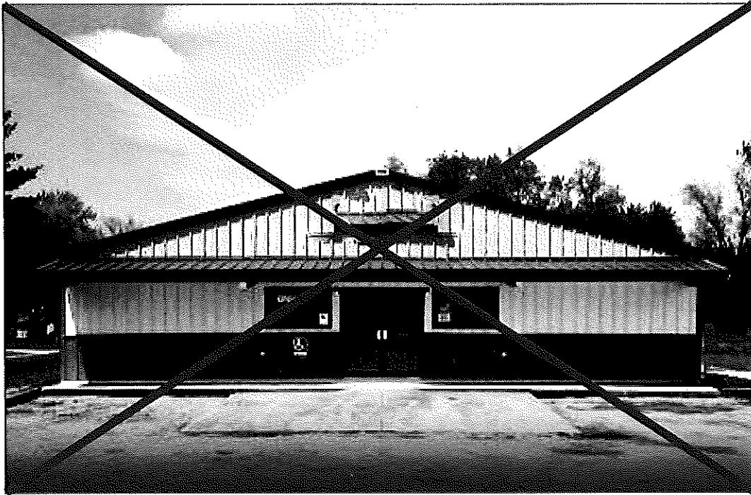
PROHIBITED Lacking Interesting Architectural Elements and Landscaping