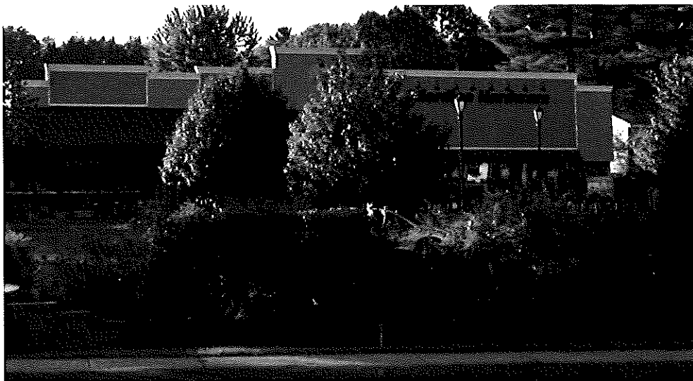
Use of Plantings & Decorative Wall