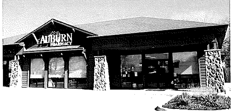
Rustic Appearance, Earth-Tone Colors, Exposed Wood and Stone